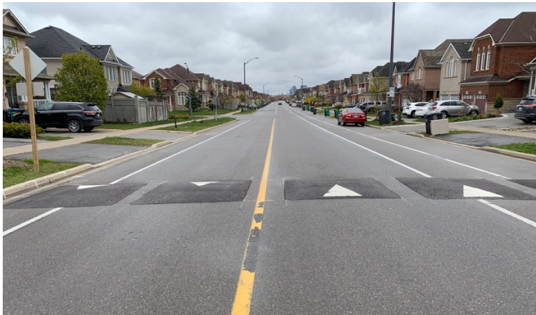
Speed cushions - Erin Centre Boulevard, Mississauga

The speed cushion is the preferred traffic calming device to be installed on Tacc Drive. A speed cushion is similar to a speed hump that does not cover the entire width of the road. Speed cushions are intended to allow for operating speeds of approximately 40km/h while allowing larger vehicles such as buses and emergency vehicles to pass without difficulty.